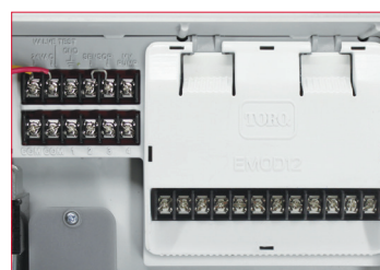
16-station configuration with (1) 12-station module