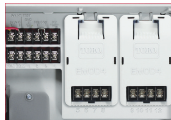
12-station configuration with (2) 4-station modules